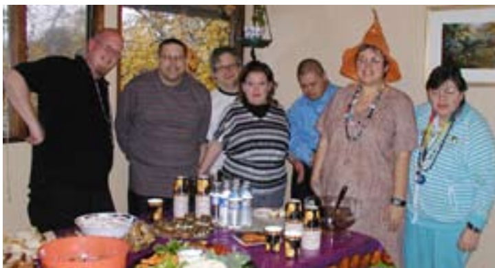
The consumers at the new Hector Street IRA in Ithaca put on quite a spread for their open house celebration in October.

Unity House opened a new individualized residential alternative (IRA) on Hector Street in Ithaca last summer, and the residents put on an open house to welcome friends to their new home. Four women now live in the residence, and a number of staff, family members, and friends stopped by on October 23 to wish them well.